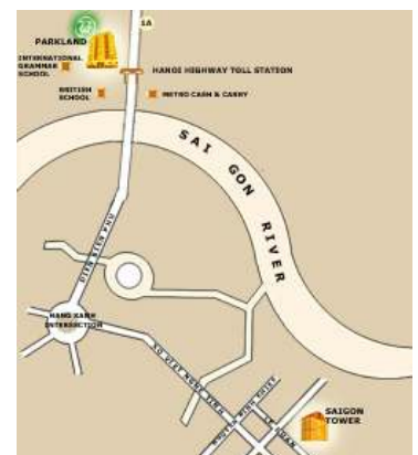
Map to Parklands

Contributions to books are welcome. No photocopied books please. Give books for donation to a staff member at the country club and they will place them in the library for you.